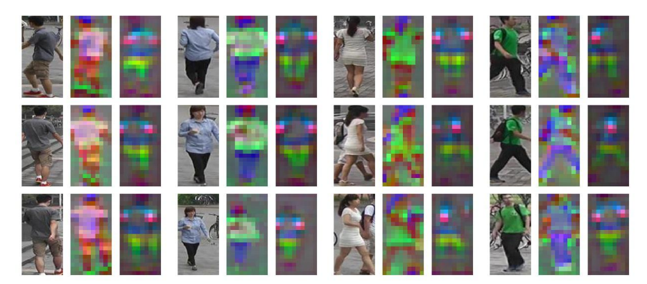
Fig. 4. Visualization of the appearance maps A and part maps P obtained from the proposed method. For a given input image (left), appearance (center) and part (right) maps encode the appearance and body parts, respectively. For both appearance and part maps, the same color implies that the descriptors are similar, whereas different colors indicate that the descriptors are different. The appearance maps share similar color patterns among the images from the same person, which means that the patterns of appearance descriptors are similar as well. In the part maps, the color differs depending on the location of the body parts where the descriptors came from. (Best viewed in color)